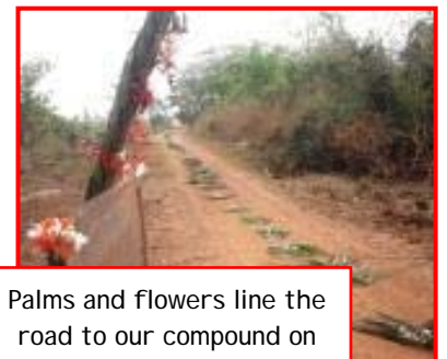
Palms and flowers line the road to our compound on Palm Sunday